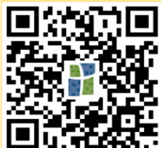
Second Sunday Lunch

Prayer, fasting, acts of service, sacrificing sweets or another luxury are all long standing traditions of Lent designed to help us deepen our faith and connect to the amazing sacrifice of Jesus. However, perhaps one of the greatest spiritual traditions of Lent is ... the fish fry. On Sunday,